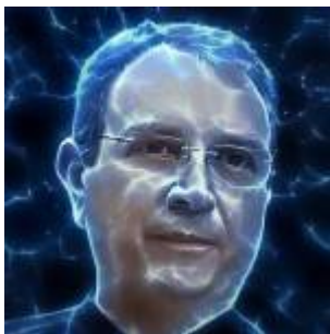
Scifi writer David Gerrold

Home Media Magazine highlighted "the film's high production values, cinema-quality special effects and the involvement of actors from the canonical Star Trek series, [elevating] Prelude to Axanar beyond the status of a mere fan film." 6)