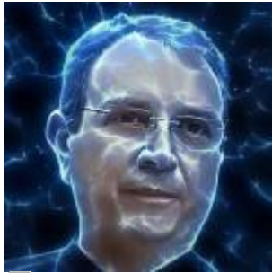
Scifi writer David Gerrold

Home Media Magazine highlighted "the film's high production values, cinema-quality special effects and the involvement of actors from the canonical Star Trek series, [elevating] Prelude to Axanar beyond the status of a mere fan film." 6)