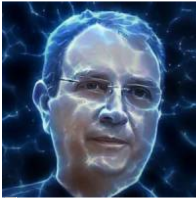
SCIFI AUTHOR David Gerrold, from his Facebook profile.