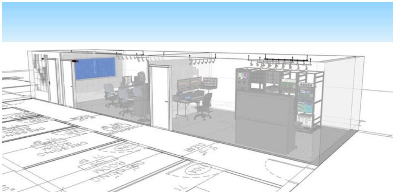
Plans for improvements to Industry Studios, the commercial facility producer Alec Peters built using funds raised from Star Trek fans for production of the film Axanar .