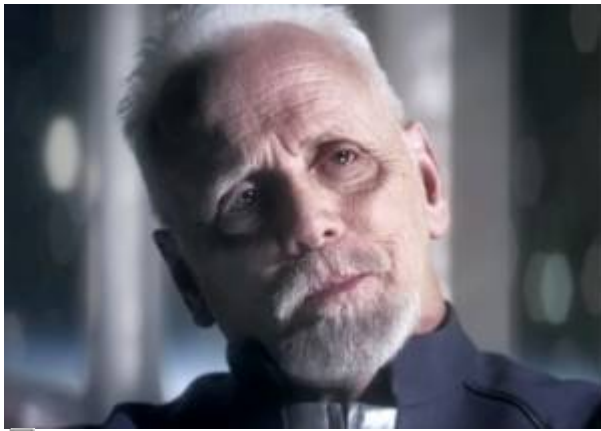
Actor J.G. Hertzler in Prelude to Axanar .