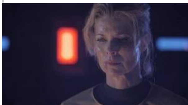
Kate Vernon as Capt. Sonya Alexander in Prelude to Axanar (2015).