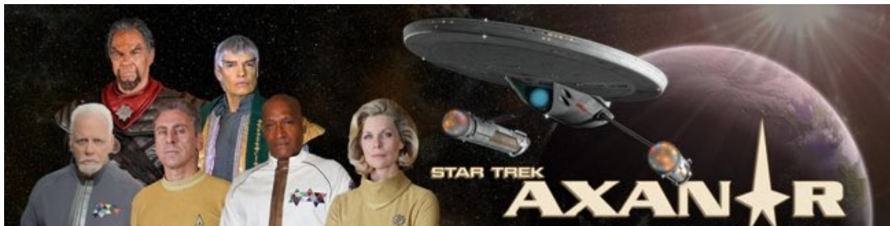
THE CAST of Prelude to Axanar , including Richard Hatch and Trek veterans Gary Graham, J.G. Hertzler, Tony Todd and Kate Vernon.