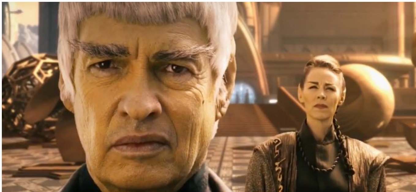
GARY GRAHAM reprised his role as Soval from Star Trek: Enterprise in both Prelude to Axanar and the 'Vulcan Scene.'