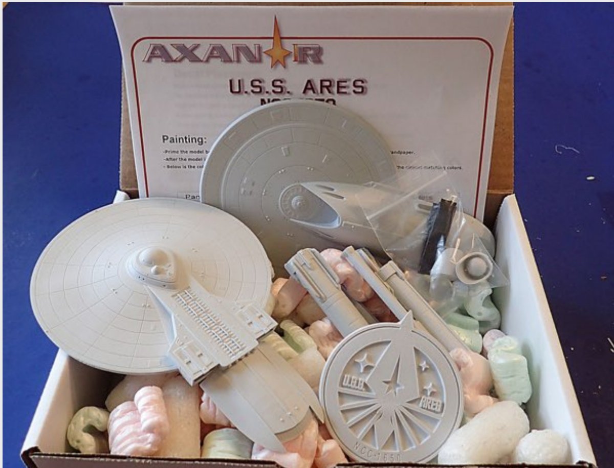
U.S.S. ARES This resin model kit is licensed by Axanar to Starcraft Models, well known for selling unlicensed models. Online reports peg its cost at $85.